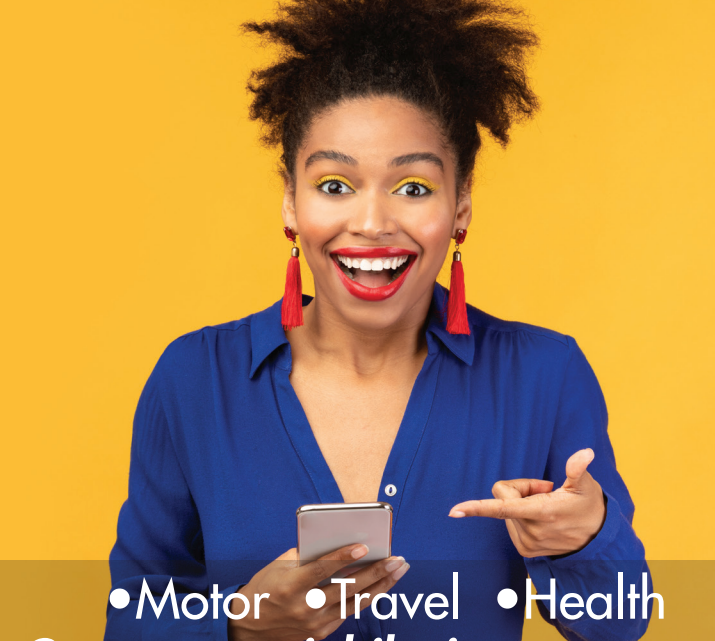
Go to: www.jubileeinsurance.com